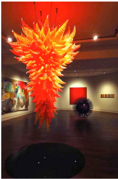
Orange Hornet a Dale Chihuly chandelier image from website linked below